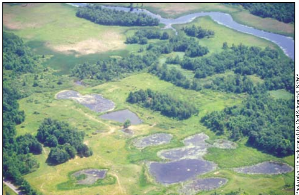
Aerial view of pothole wetlands surrounded by grasslands—typical habitats of the St. Lawrence Valley.

U.S. Fish & Wildlife Service http://www.fws.gov November 2005